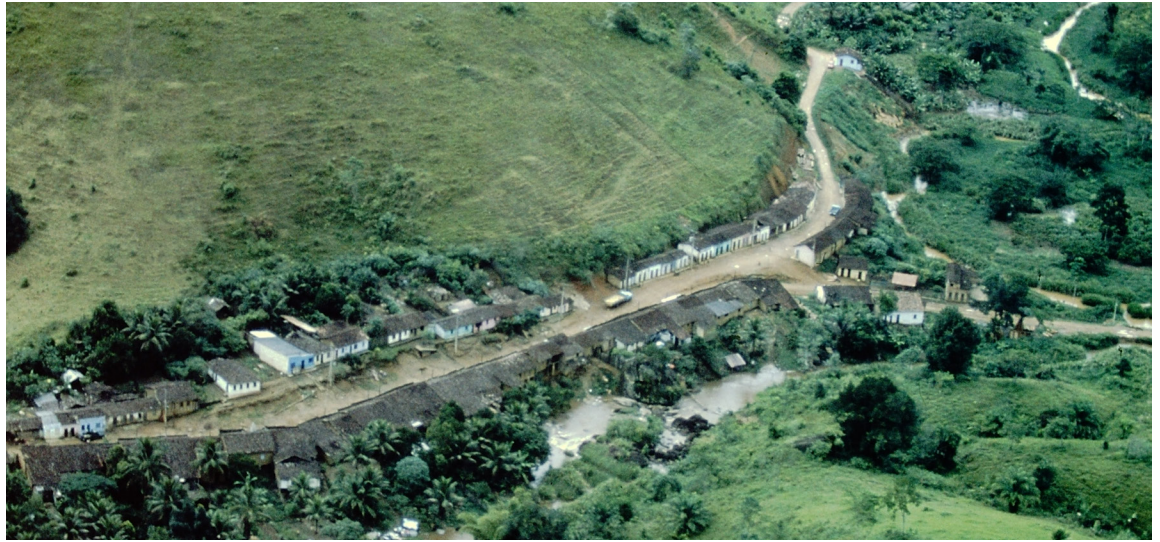
Field research area for leishmaniasis, Três Braços, Brazil

Similar strategies are being used to find molecular signatures that can be targets for therapy and immunomodulation in the human hosts. In addition, advances in a technological framework called Geographic Information Systems (GIS) have created opportunities to study disease-environment interactions in ways not previously possible.